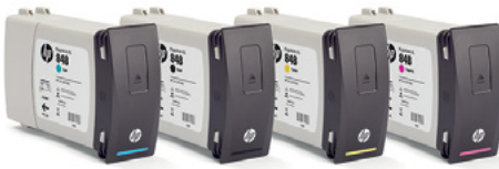
8 HP PageWide XL ink cartridges (2 x 400-ml per color with auto-switch)

The HP PageWide XL 5000 Printer series includes a stationary 40-inch (101.6-cm) printbar that spans the whole printing width. As paper moves under the printbar, the entire page is printed in one pass, enabling very high printing speeds.