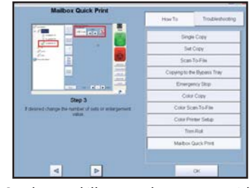
On demand illustrated operator guides

The KIP System Guide is available at the KIP 7700/7900 operator panel and downloadable via KIP PrintNET to assist operators by providing a quick reference resource for all KIP application features.