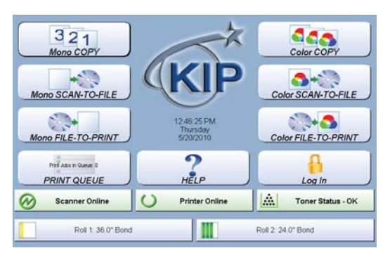
Perform all scan, copy and print functions using the integrated touchscreen user interface

Color scanning, copying and printing is accomplished directly from the KIP touch screen display with preset selections for image quality, file naming, copy or print count, image sizing, and rotation. KIP delivers world class color scanning, copying and printing directly to industry standard inkjet printers that have been fully integrated with KIP software.