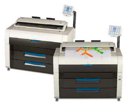
KIP 7700/7900 Multifunction Systems