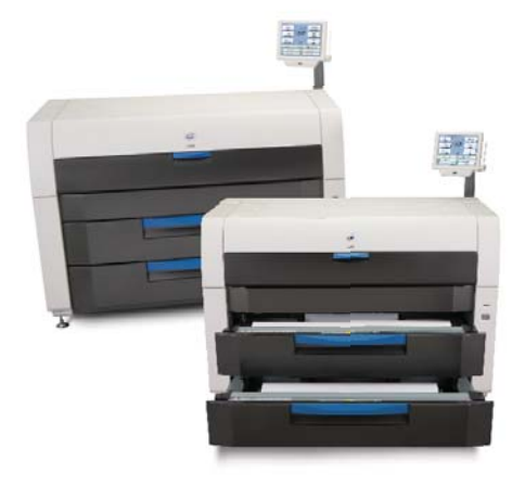
KIP 7700/7900 Network Printing Systems

The system automatically senses the original document width and dynamically adjusts exposure settings during the scanning process for maximum quality.