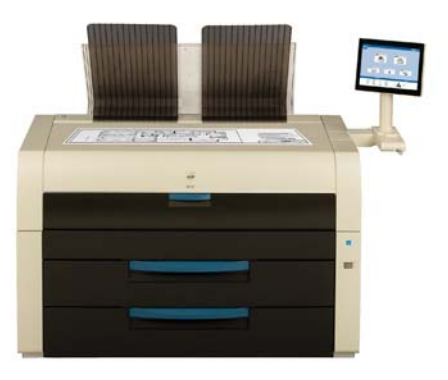
KIP 7970 Print Systems