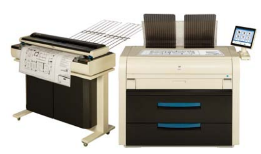
KIP 7590 Production MFP Shown with optional KIP scanner stand