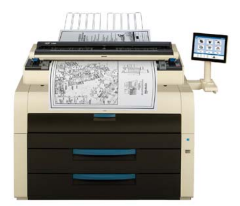
KIP 7990 Production MFP