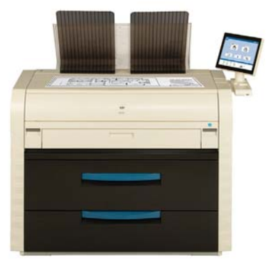
KIP 7570 Print Systems