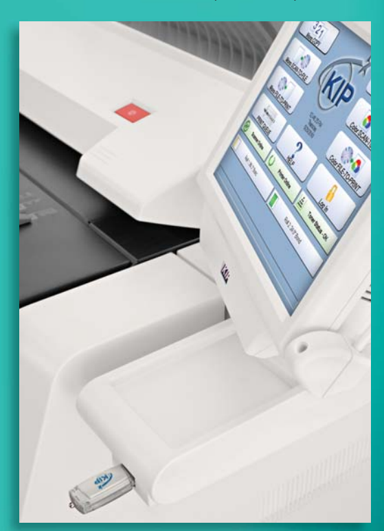
KIP 7100 Integrated USB Port