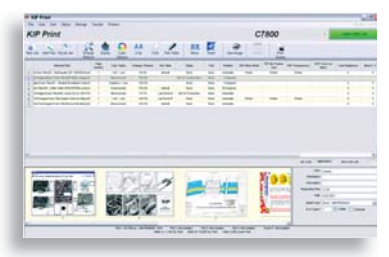
Intuitive New Ribbon Style Interface

KIP Print KIP Print network printing software is an easy to use application designed to provide operators with a fast and accurate means of producing high quality print sets from all types of wide format digital files. An intuitive ribbon style interface with an emphasis on job building; featuring column browsing, color thumbnail previews and total preflight control. Color and B&W documents are efficiently selected for printing in collated sets with the ability to designate custom output preferences before print submission.