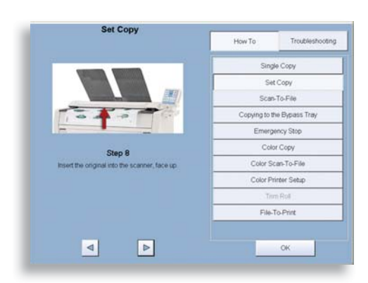
KIP 7100 On Screen Operator Guides

KIP 7100 system operation is simplified with direct access by the operator to the touchscreen system & operator guides. Remote access to the guides is achieved via KIP PrintNET web solutions.