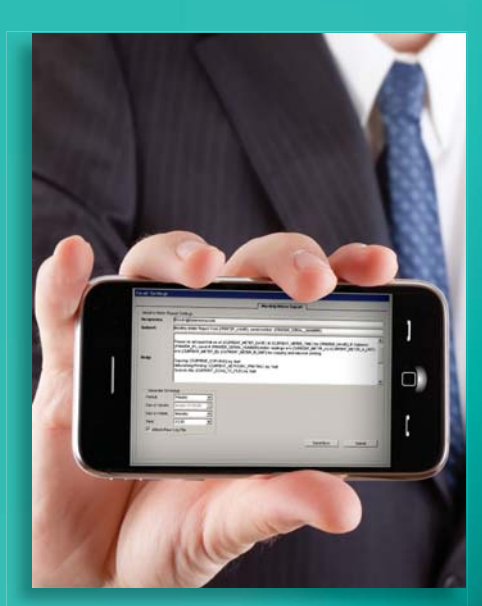
Reports Delivered Conveniently by Email