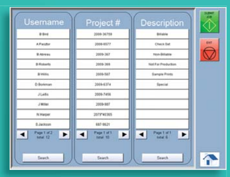
KIP Track Print, Copy & Scan Controls